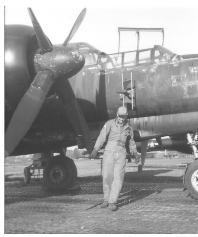
Had to "pull-through" the props on the P-61s big R-2800s every morning, before flight. "Murt" Shields at work

THE MONTH OF JULY SAW THE SQUADRON GAINING MOMENTUM UNDER THE ABLE DIRECTION OF THE SQUADRON COMMANDER, MAJOR KONOSKY. ON THE 2 JULY, 1946 THE SQUADRON WAS HONORED WITH A SHORT INSPECTION TOUR BY GENERAL SPAATZ.