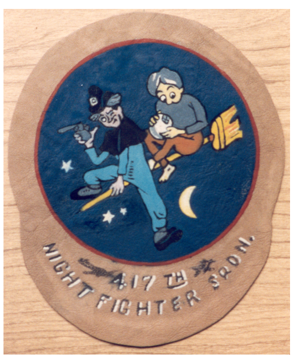
Noel Howard designed and drew the Broom Stick and Crystal Ball logo used by the 417th NFS after transitioning to the P-61s.

12 HOURS. IN ADDITION TO DAY NAVIGATION THERE WERE A NUMBER TRANSITION HOURS IN THE L-5. THE SQUADRON DID NOT ENGAGE IN ANY NIGHT FLYING. HOWEVER, AS SOON AS WEATHER CONDITIONS PERMIT, THERE WILL BE NIGHT FLYING.