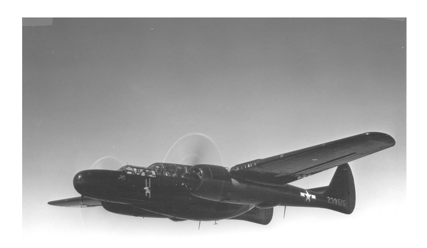
P-61B-6-NO, #42-39515 in Flight, similar to most of the P-61s in the 417th NFS, Northrop photo.