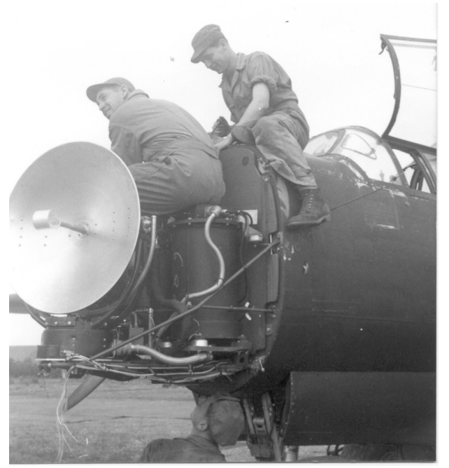
P-61 Radar repairs, Bolinski & Fields on top of plane, Rich Ziebart below radar while at Fritzlar, Germany.