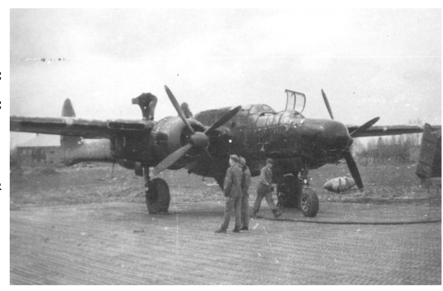
P-61 after the guys took the wing tanks off, Schweinfurt.

THE SQUADRON ENLARGED SOMEWHAT ON OFFICER PERSONNEL, AND GAINED SEVERAL RADAR OBSERVERS. MOST OF THE PILOTS GAINED ARE NOT CHECKED OUT IN THE P-61, BUT ONE A-26, ONE